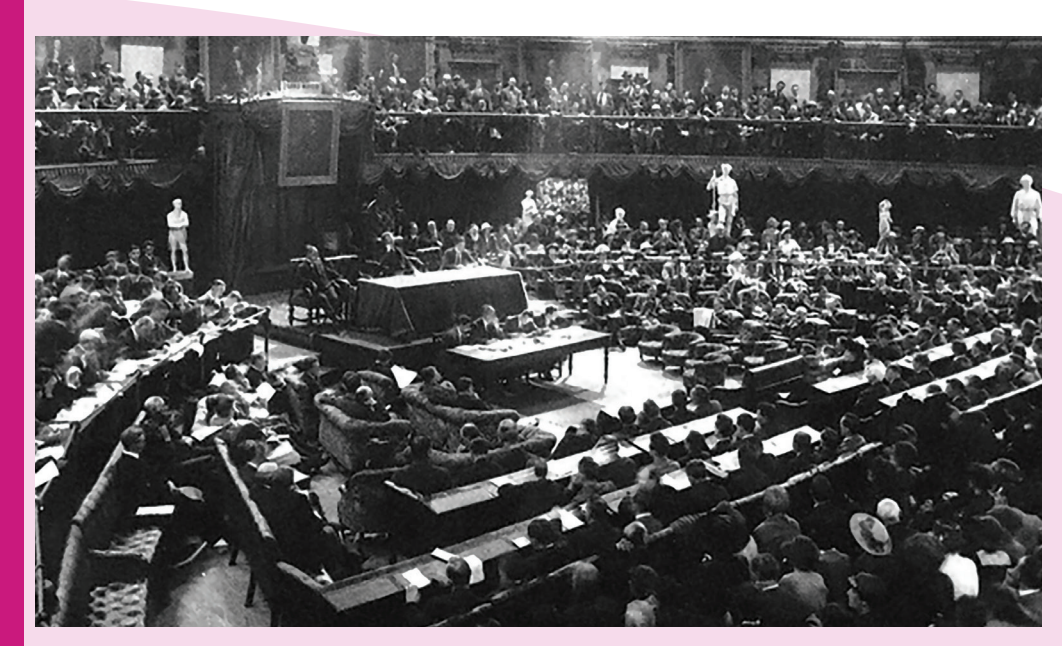
The Dáil sitting in the Mansion House in 1921

We reaffirm the Republic's independence and sovereignty. We also acknowledge the inherent dignity and the equal and inalienable rights of all members of the human family. Through the European Union and the United Nations, the Republic shall promote international peace and co-operation with other countries, further the wellbeing of all peoples and strive for worldwide ecological sustainability.